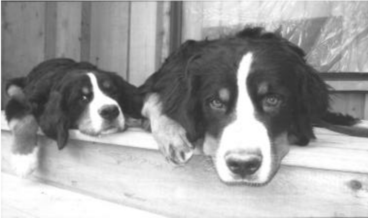
Woofit and Chi

Please label the picture with your name, the name of your animal friend or friends in the picture, and any caption you would like printed.