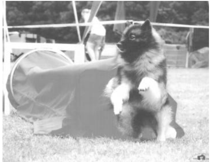
Gandolf heading for a win